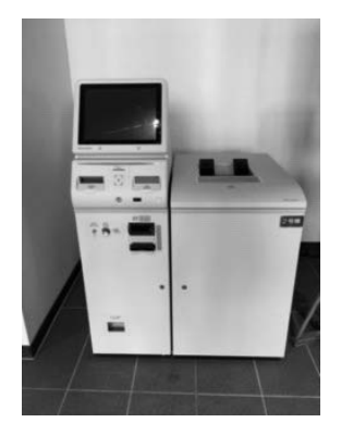
Certification Issuing Machine, 1st floor, Ryoshinkan

If you need certificates specified by other institutes, you can pay the fee for the certificates with the Certificate Issuing Machine, then visit the Office of the Center for Global Education and Japanese Language and submit the application of certification which is issued by the machine. We will be able to issue it after 3-days from your application date. We do not accept applications by proxy or by phone.