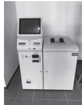
Certificate Issuing Machine, 1st floor, Ryoshinkan

If you need certificates specified by other institutes, you can pay the fee for the certificates with the Certificate Issuing Machine, then visit the Office of the Center for Global Education and Japanese Studies and submit the application of certification which is issued by the machine. We will be able to issue it after 3-days from your application date. We do not accept applications by proxy or by phone.